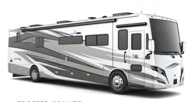
G5 FROSTED GRANITE