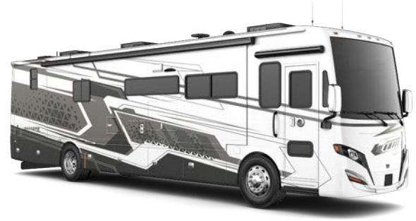
G6 FROSTED GRANITE

Images shown are representations of paint layouts only and do not reflect all exterior features or options. Colors shown may slightly differ from colors on actual product.