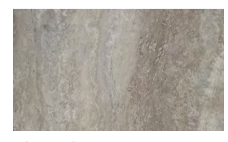
MONTEANO LUXURY VINYL TILE