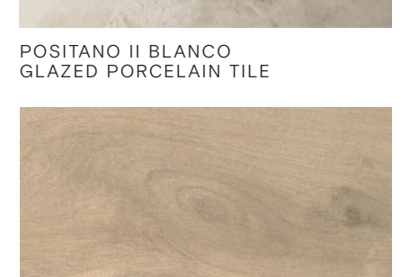
NATIVE BIRCH MATTE PORCELAIN TILE