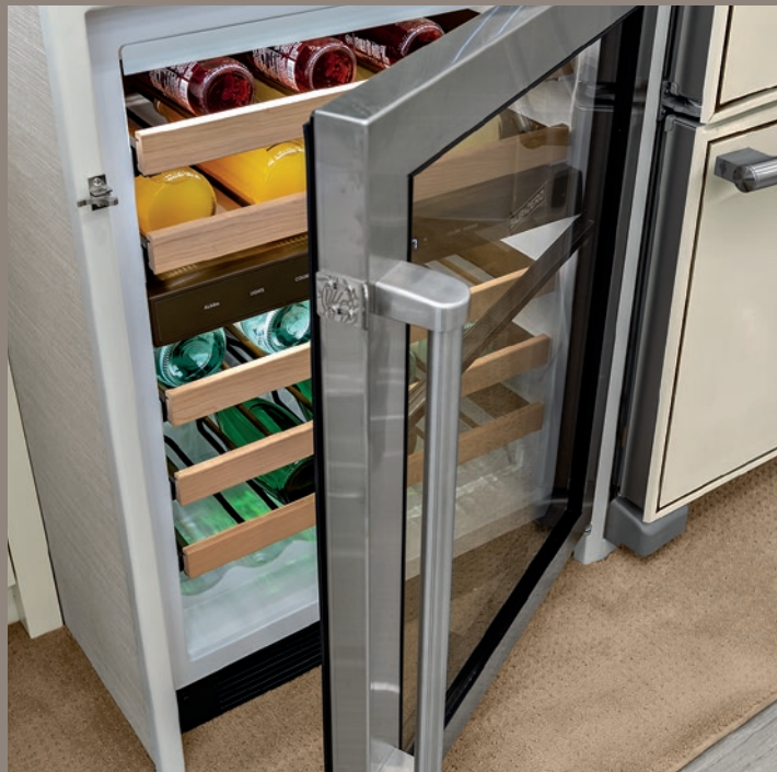
Top to bottom: Optional Wolf Coffee Center; Optional Beverage Center.