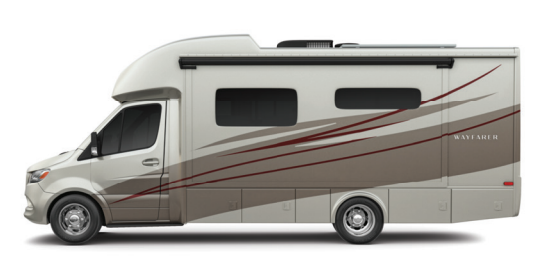
G4 SAND DRIFT