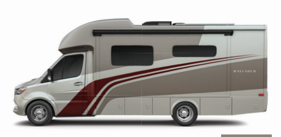
G5 SAND DRIFT