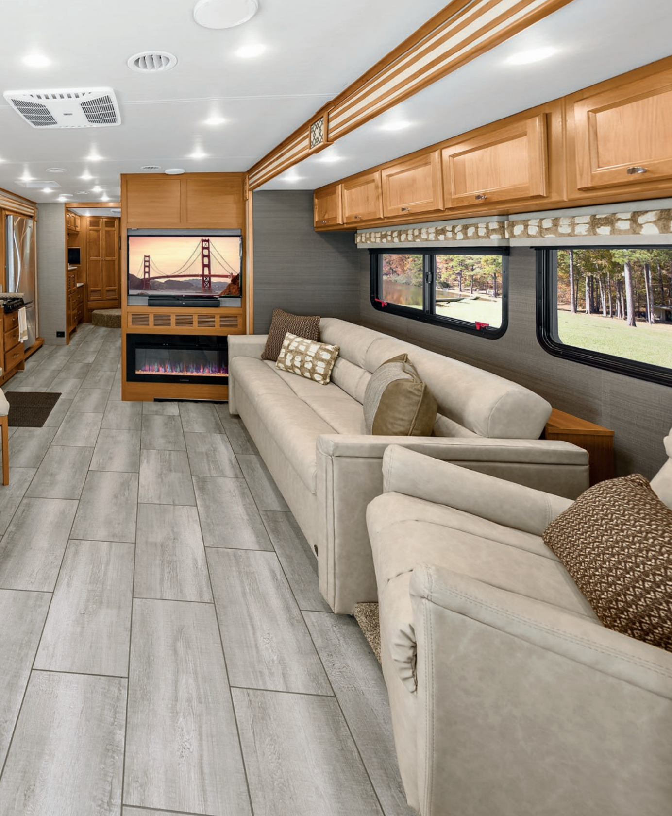
Top to bottom: Living Area; Sofa with optional Fireplace; Sofa bed expanded.