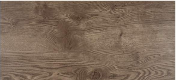
SEA OAT (O)