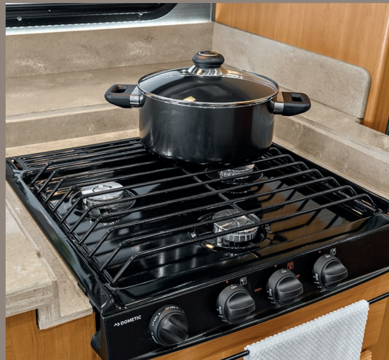
Top to bottom: Sink; 3-burner cooktop.