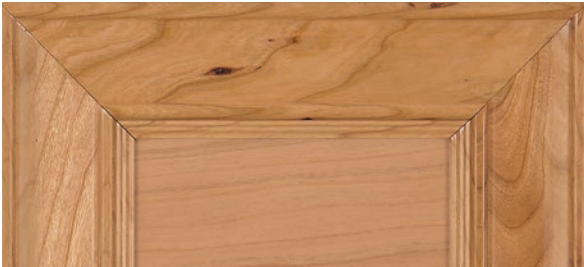
NATURAL ALDER (O)