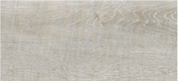
SAND CASTLE (S)