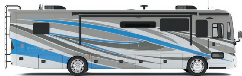
G1 GLACIER BLUE