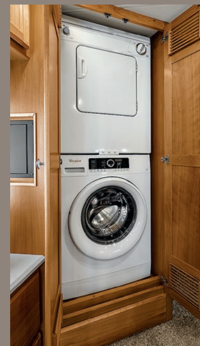
Clockwise from top: Master Bathroom vanity; Optional Stacked Washer and Dryer; Shower.