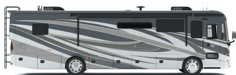
G1 SLATE GRAY