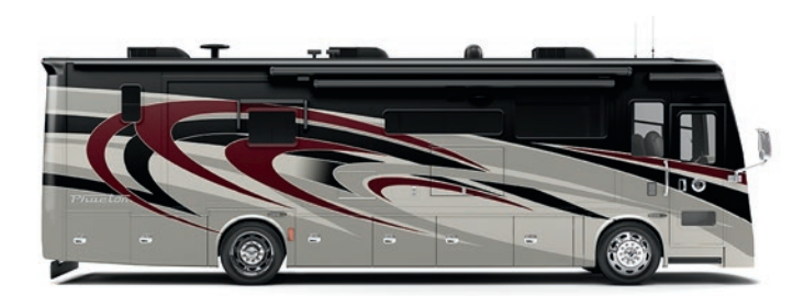
G9 SUNLIT SAND