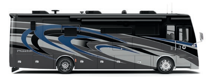
G9 EURO BLUE