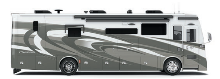
G9 FROSTED GRANITE