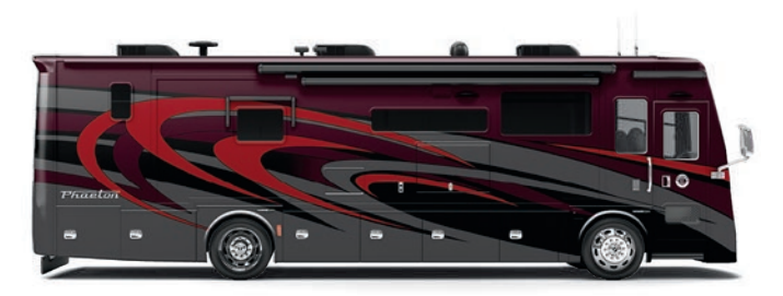
G9 FIRE OPAL