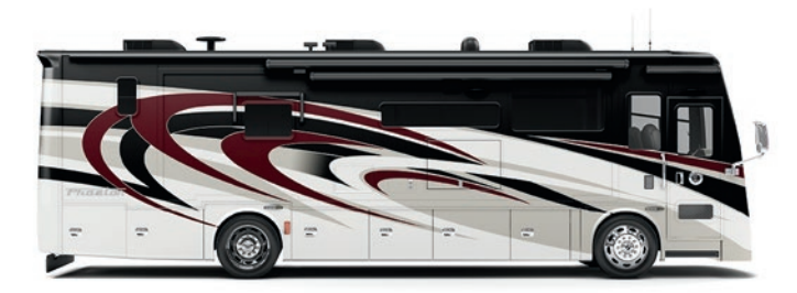
G9 MAROON CORAL

For a complete and up-to-date list of available options and specifications, visit tiffinmotorhomes.com.