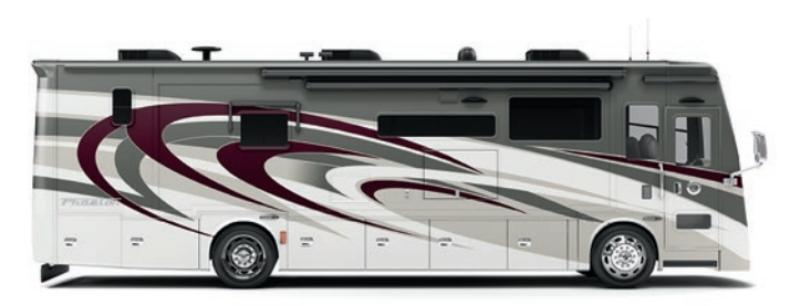
G9 WHITE MAHOGANY