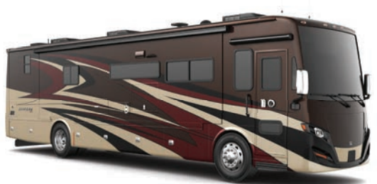
G4 RUSTIC CANYON