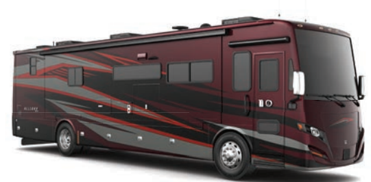
G5 FIRE OPAL