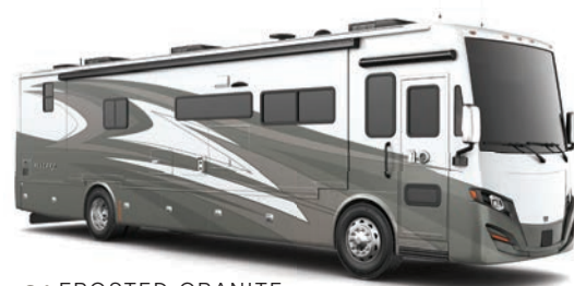
G4 FROSTED GRANITE