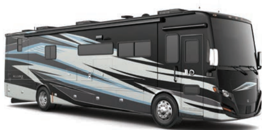
G5 EURO BLUE