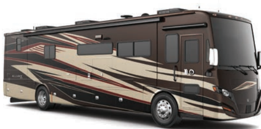
G5 RUSTIC CANYON