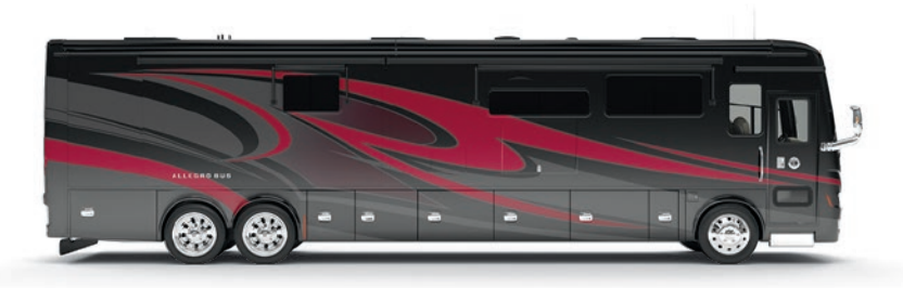
G9 FIRE OPAL