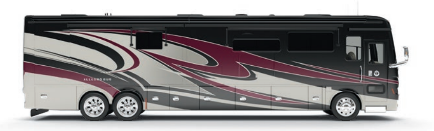
G9 SUNLIT SAND