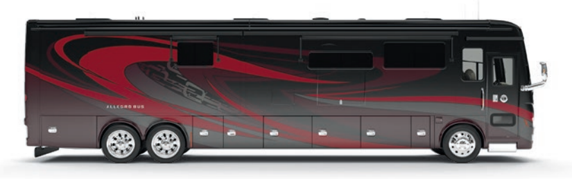
G10 FIRE OPAL