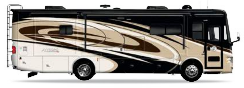
ROCKY MOUNTAIN BROWN