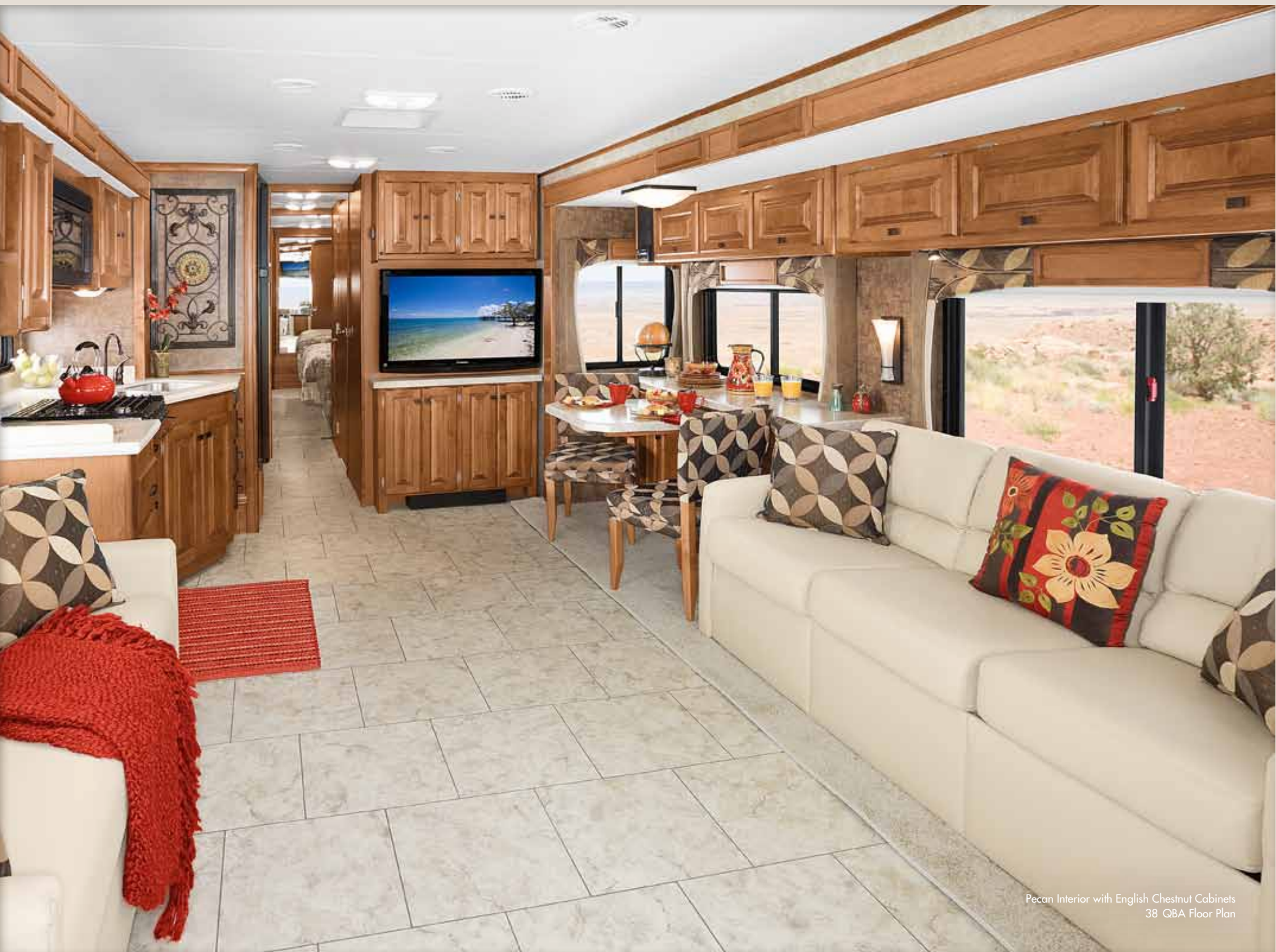
Pecan Interior with English Chestnut Cabinets 38 QBA Floor Plan