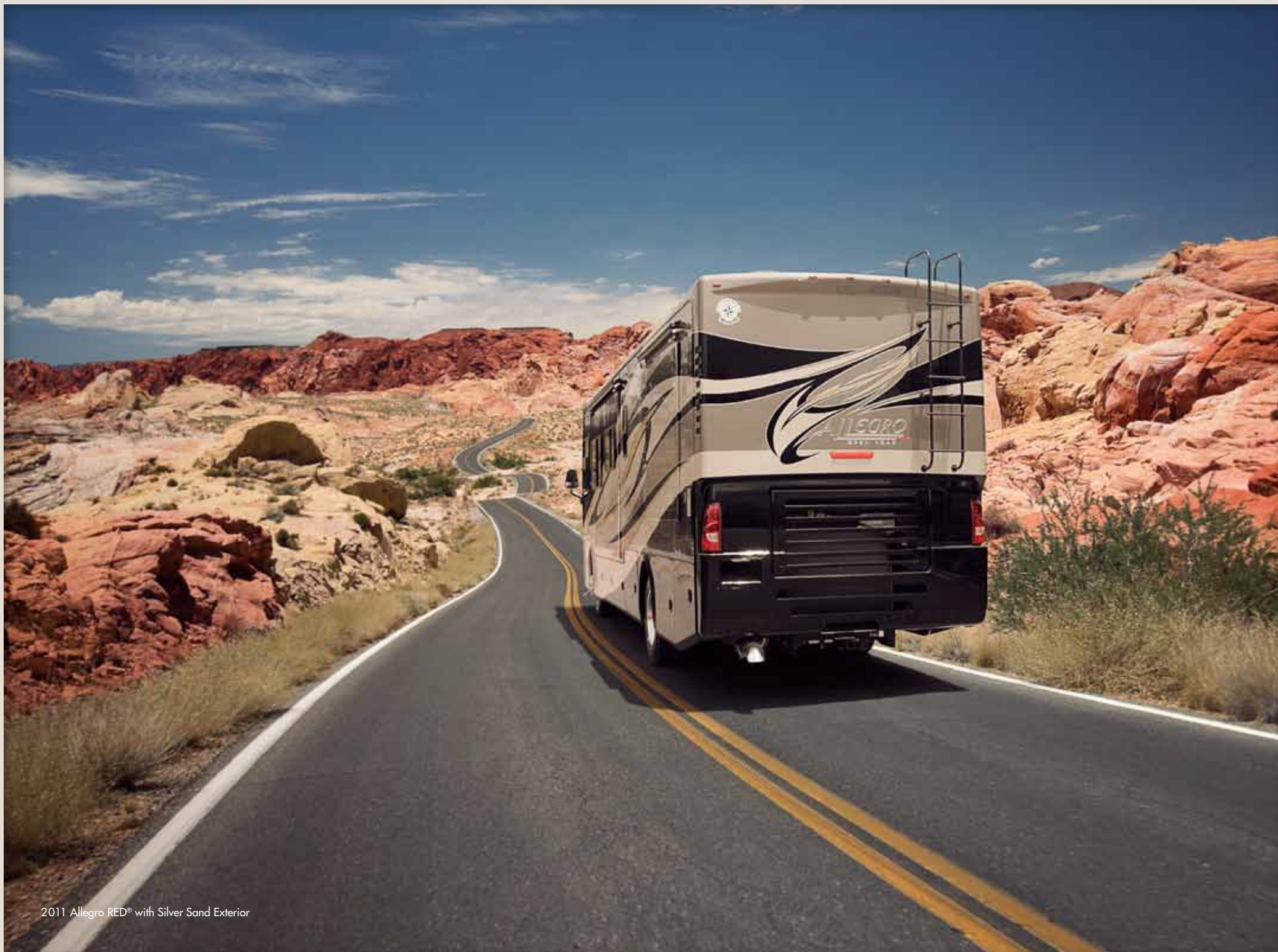
2011 Allegro RED® with Silver Sand Exterior