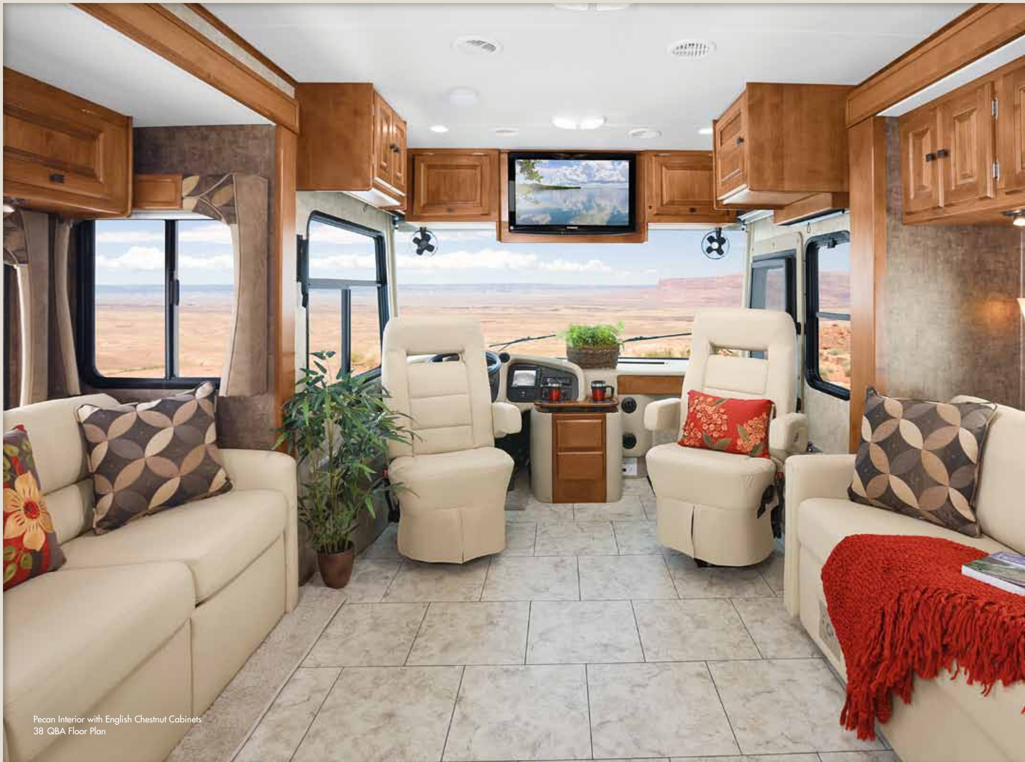
Pecan Interior with English Chestnut Cabinets 38 QBA Floor Plan