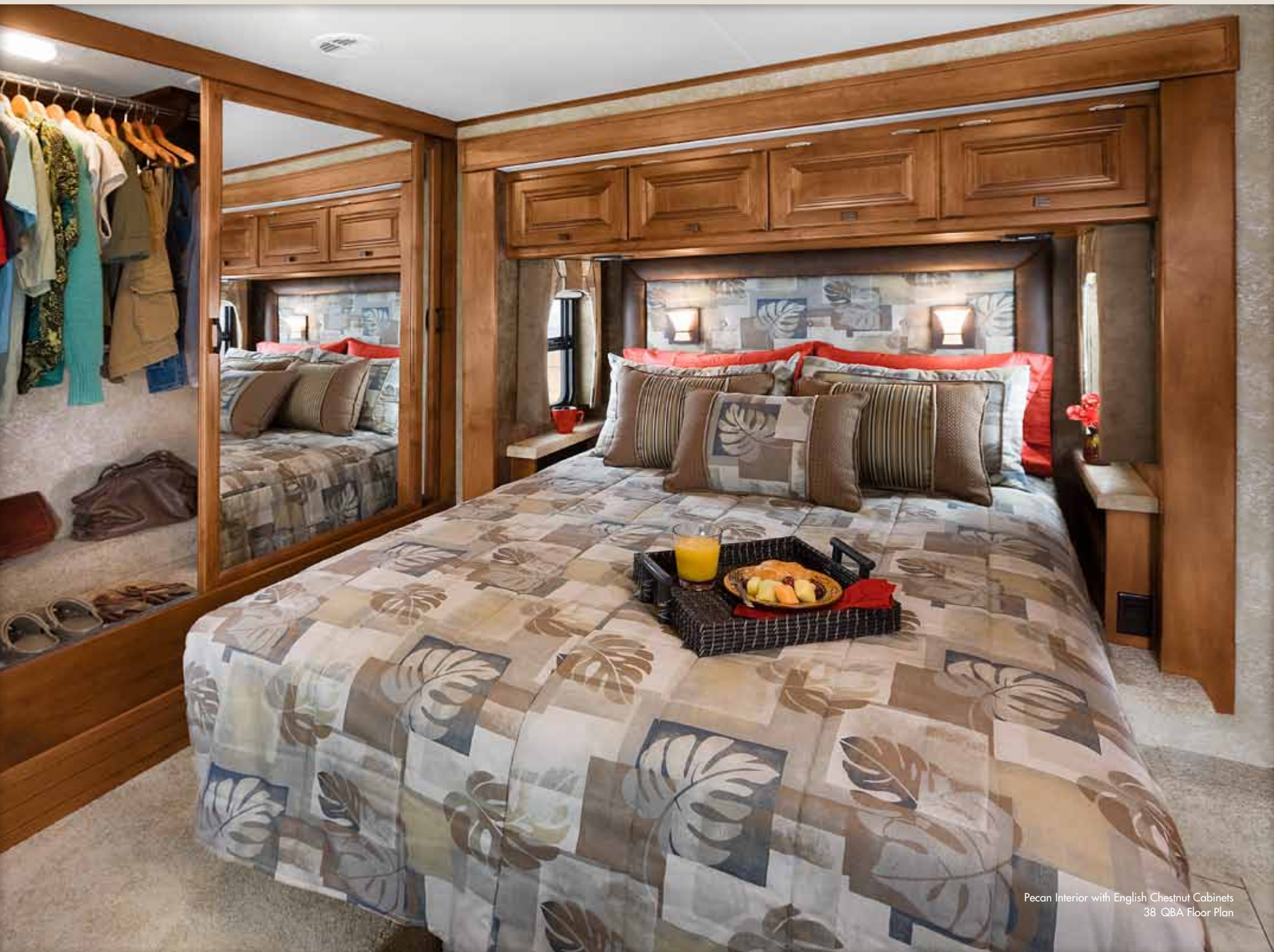
Pecan Interior with English Chestnut Cabinets 38 QBA Floor Plan