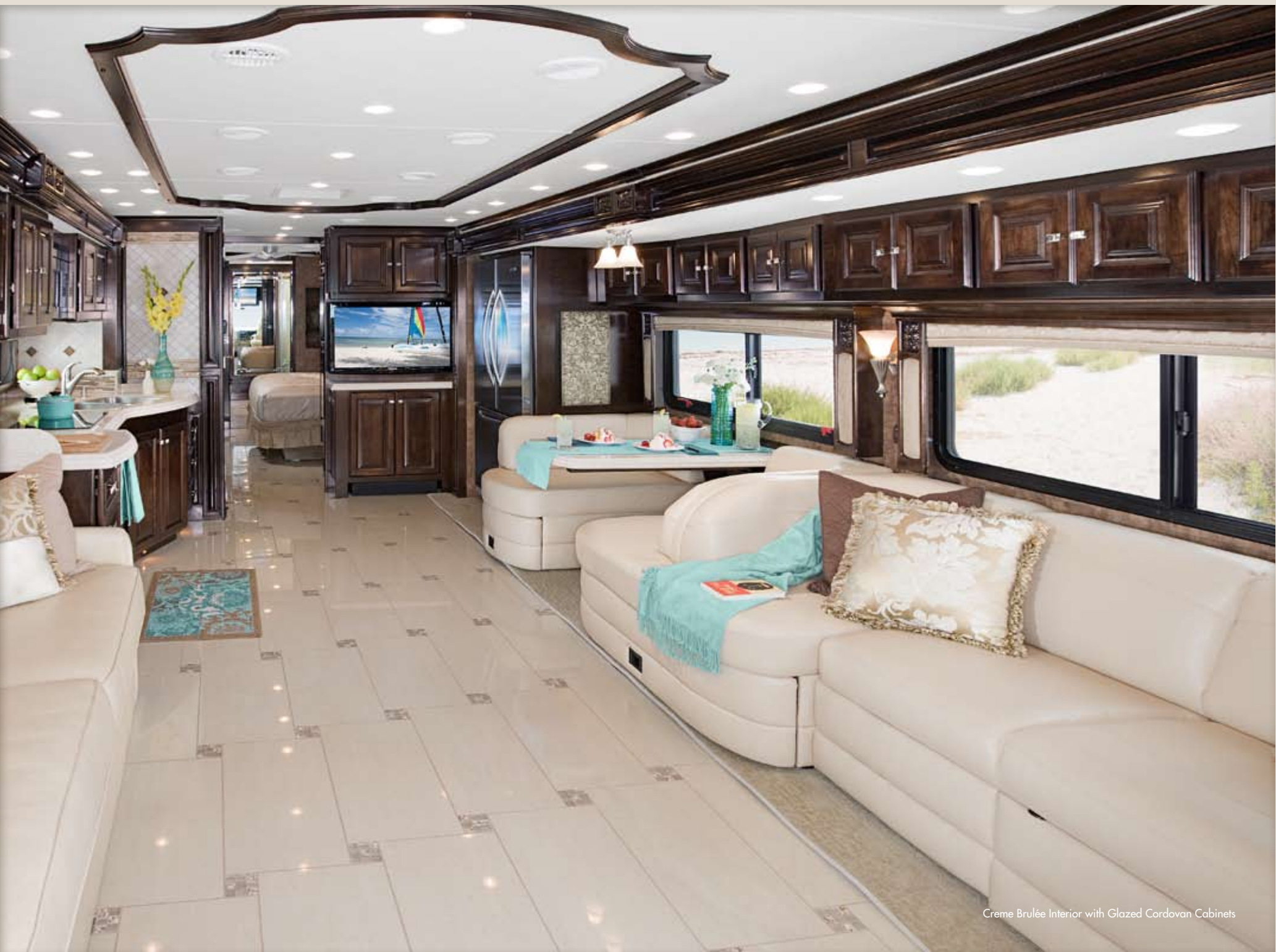
Crème Brûlée Interior with Glazed Cordovan Cabinets