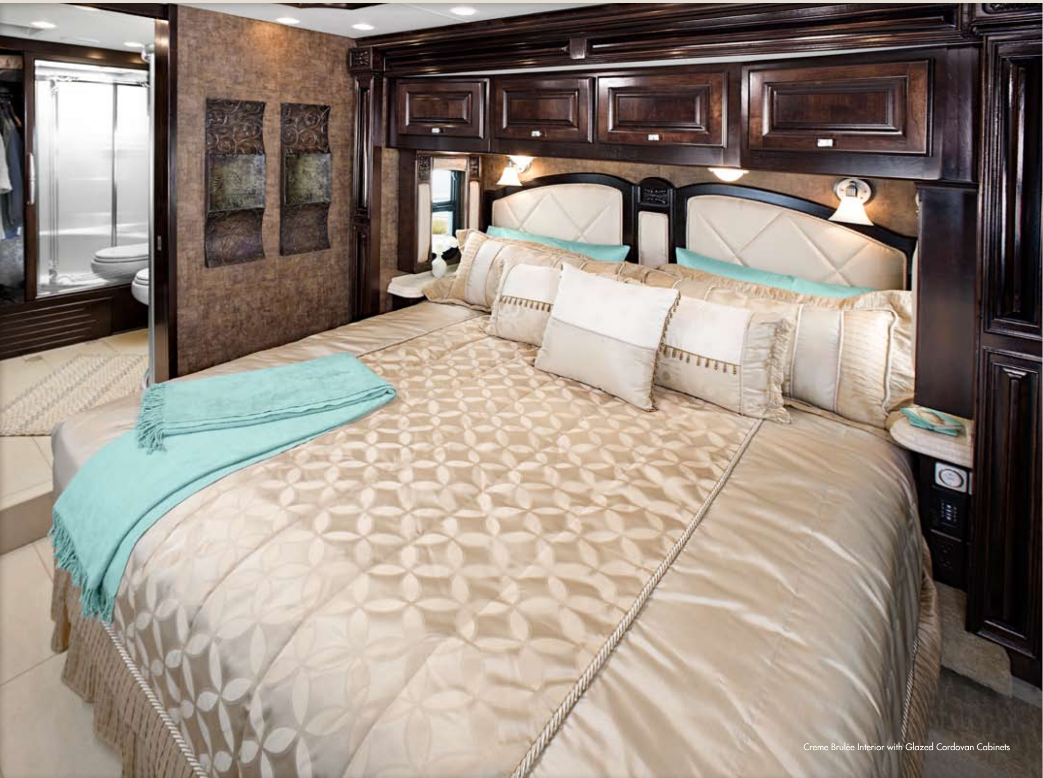
Creme Brûlée Interior with Glazed Cordovan Cabinets