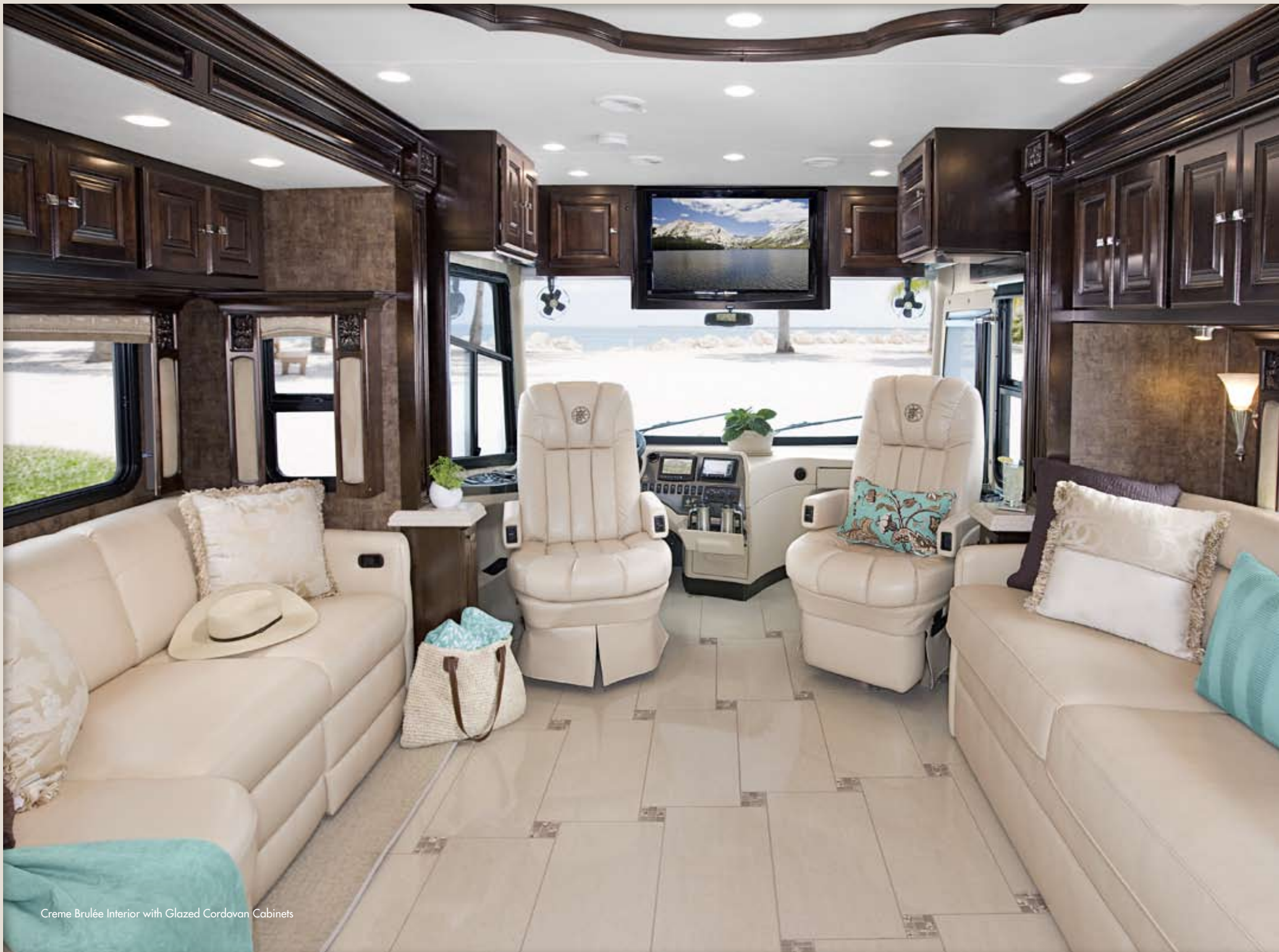
Crème Brûlée Interior with Glazed Cordovan Cabinets