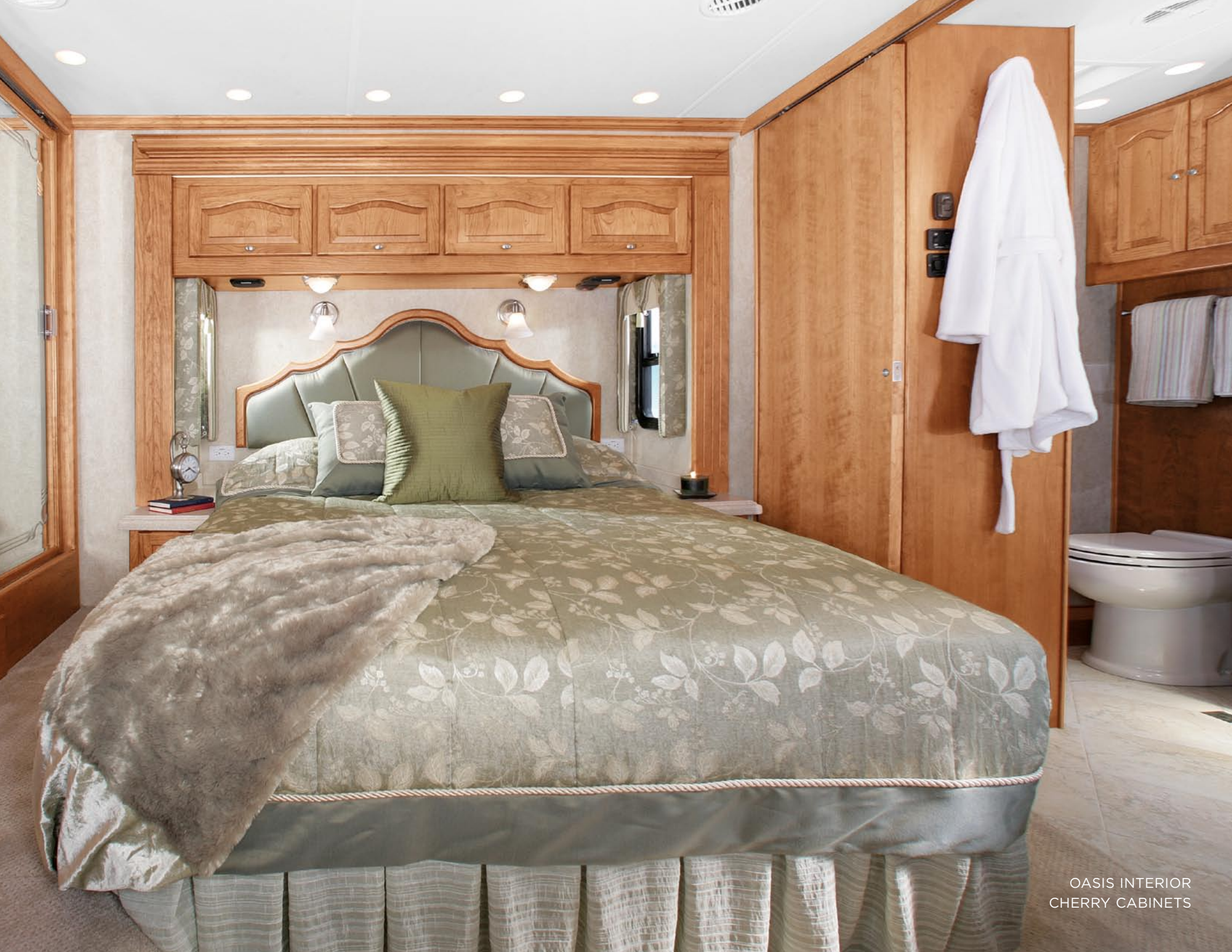
OASIS INTERIOR CHERRY CABINETS