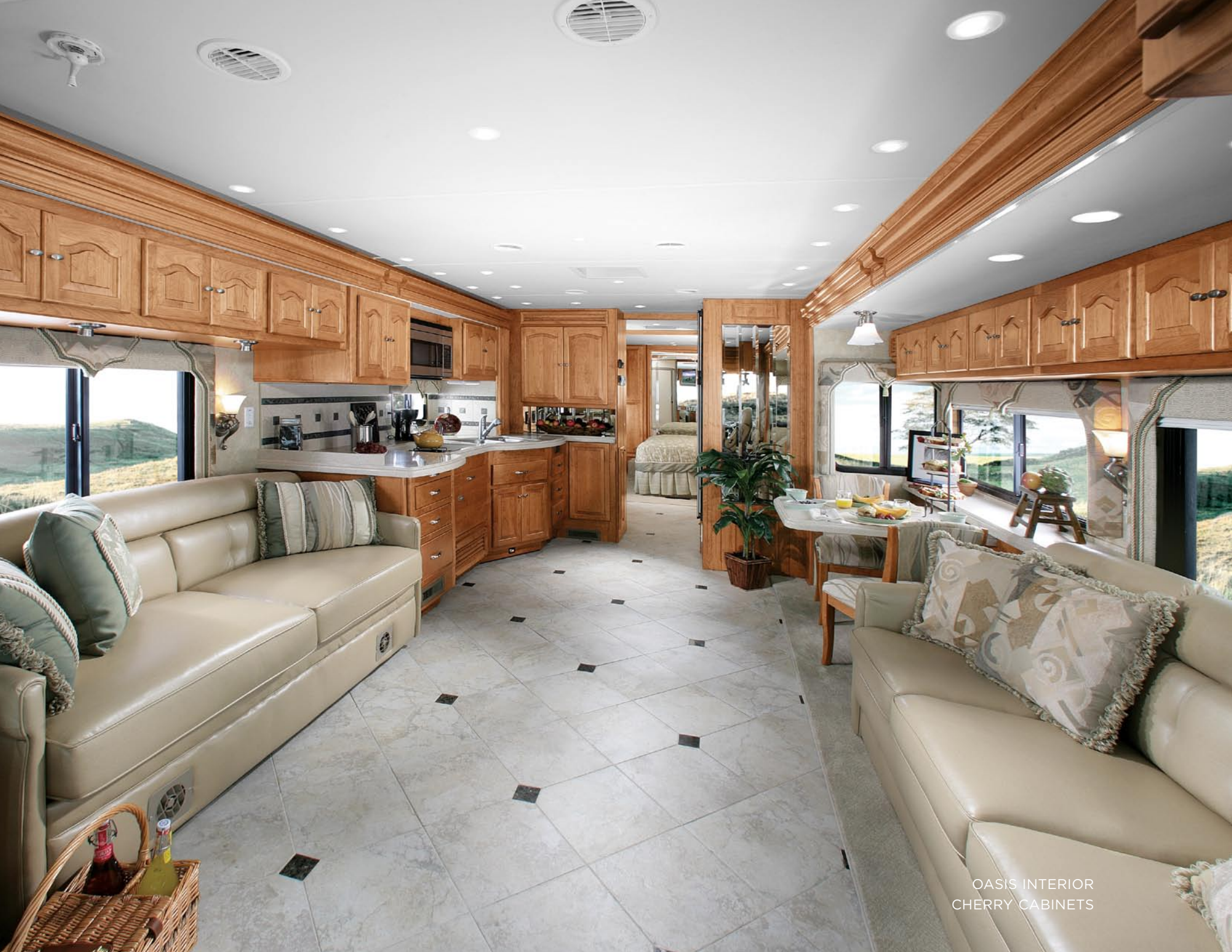
OASIS INTERIOR CHERRY CABINETS