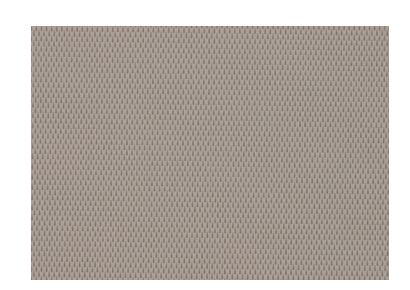
TAUPE HILL (O)