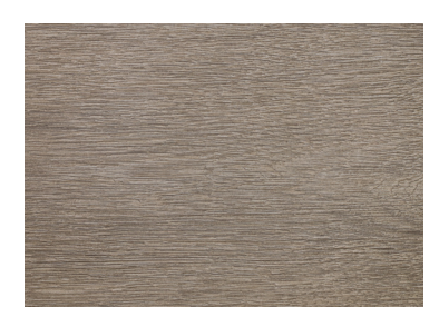
SEAGRASS Matte Finish Tile