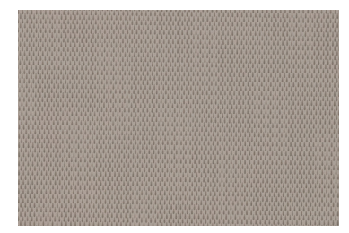
TAUPE HILL (O) NEW