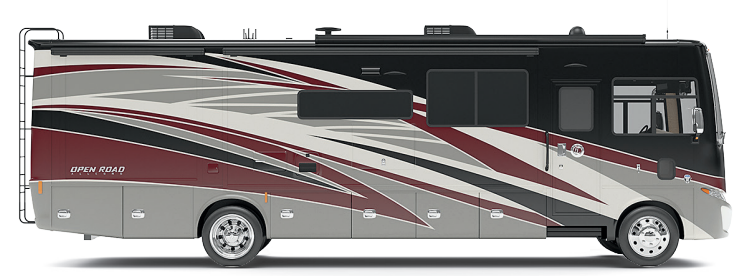
G9 SUNLIT SAND