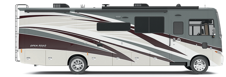
G10 WHITE MAHOGANY