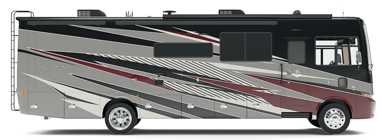
G10 SUNLIT SAND