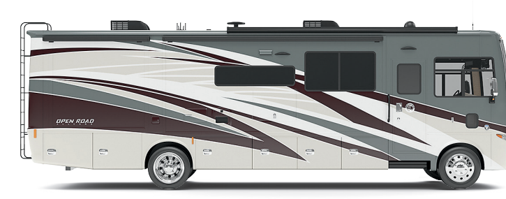
G9 WHITE MAHOGANY