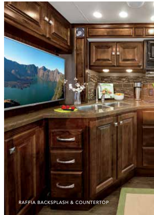
RAFFIA BACKSPLASH & COUNTERTOP