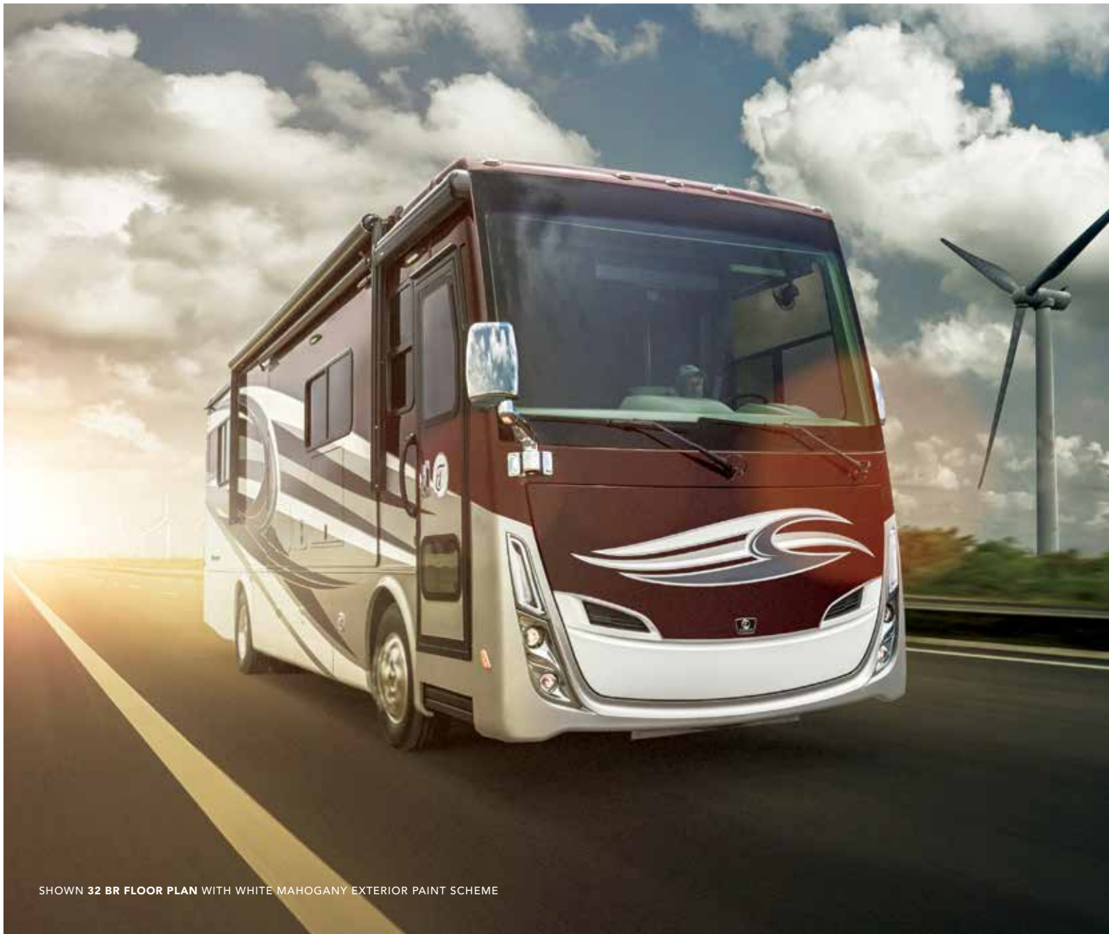
SHOWN 32 BR FLOOR PLAN WITH WHITE MAHOGANY EXTERIOR PAINT SCHEME