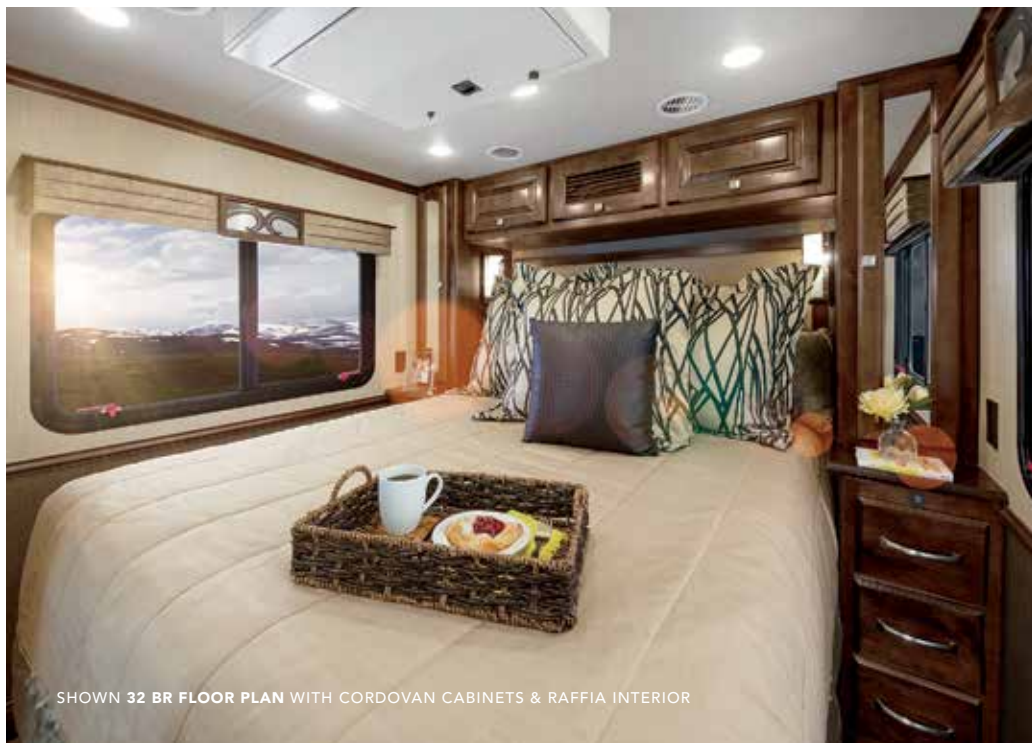
SHOWN 32 BR FLOOR PLAN WITH CORDOVAN CABINETS & RAFFIA INTERIOR