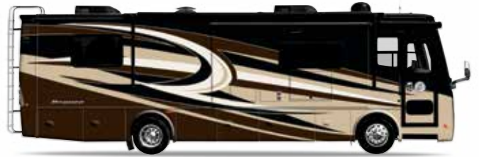
ROCKY MOUNTAIN BROWN