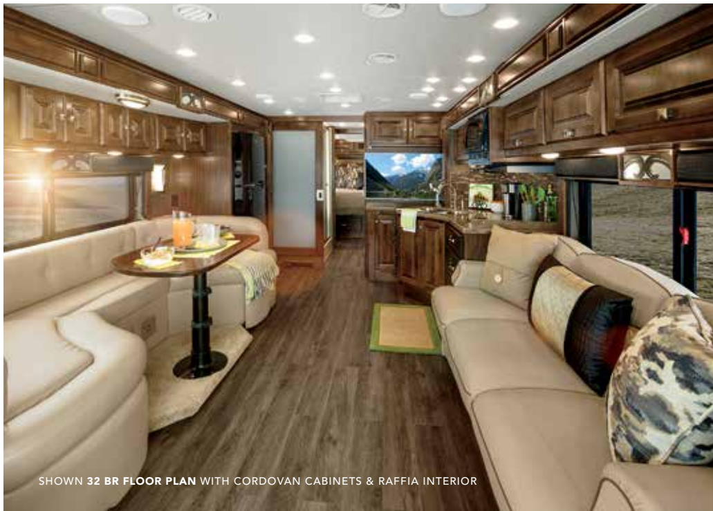
SHOWN 32 BR FLOOR PLAN WITH CORDOVAN CABINETS & RAFFIA INTERIOR